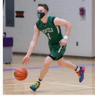
Scholar-Athlete of the Year