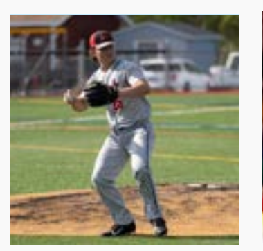
Scholar-Athlete of the Year